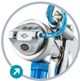
Robust stainless steel air head

Suitable for left and right handed users