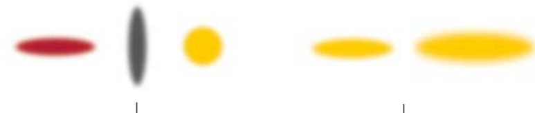
Spray jet width adjustment

The spray jet can be set precisely to the subject with one movement directly on the gun.